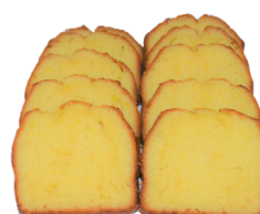
Lemon Pound Cake