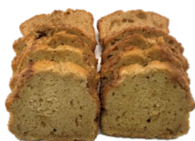
Apple Crisp Loaf

Packages are unlabeled, allowing you to print and attach your bakery's label