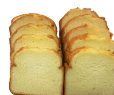
Butter Pound Cake

Leverage our great seasonal selection to generate "Limited Time Only" excitement during opportunistic selling windows!