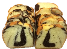
Marble Pound Cake

Gross Case Weight: 17.25 lb. Net Case Weight: 15.75 lb. Dimensions: 23.63 x 16.75 x 8.62 Ti/Hi: 5 x 8 Cube: 1.98 Cf Storage: 0° or below Shelf Life Frozen: 364 days Shelf Life Ambient: 7 days