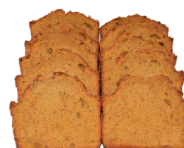
Pumpkin Loaf (seasonal)

Gross Case Weight: 17.25 lb. Net Case Weight: 15.75 lb. Dimensions: 23.63 x 16.75 x 8.62 Ti/Hi: 5 x 8 Cube: 1.98 Cf Storage: 0° or below Shelf Life Frozen: 364 days Shelf Life Ambient: 7 days